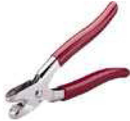
Snap Lock Punch (crimper)