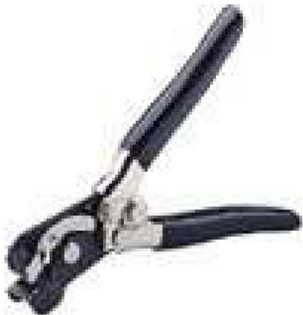
Nail Hole Punch