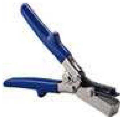
J-Channel Cutter 1/2" & 3/4"