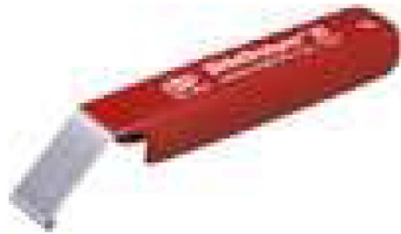
Removal Tool (zippy)